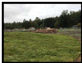
The hill in the middle of the playground got sodded this weekend! Doesn't it look great!

The new playground is really coming together thanks to all of our volunteers. We have one more work party and then we should be ready to take down all of the fencing.