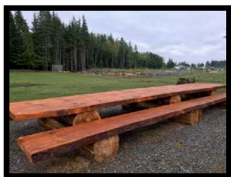
Many of our classes have taken advantage of this amazing new space for taking learning outdoors.